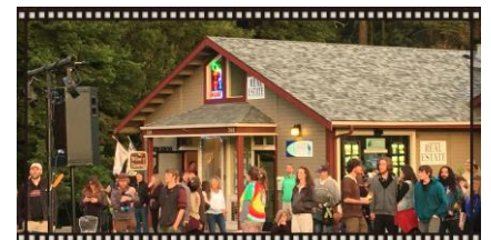
Trinidad Art Night – May 2016